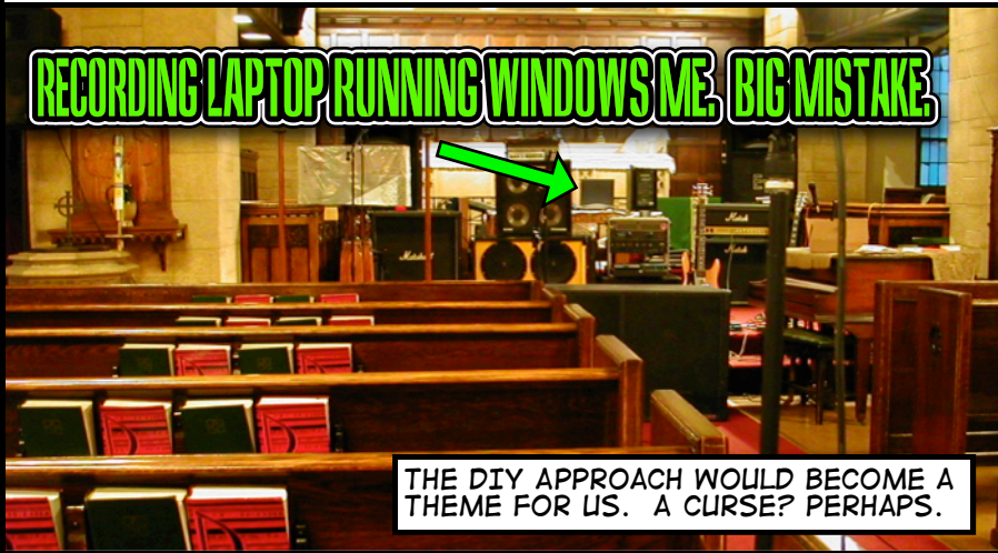
THE DIY APPROACH WOULD BECOME A THEME FOR US. A CURSE? PERHAPS.

RECORDING LAPTOP RUNNING WINDOWS ME. BIG MISTAKE.